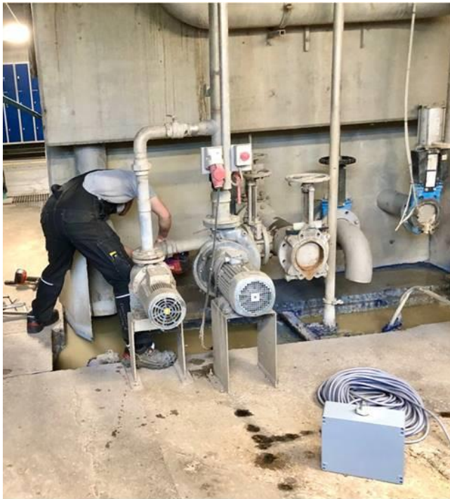
Figure 3: Water use in a paper mill

Paper mills do not limit themselves to treating wastewater intended for discharge, to ensure production continuity and maintain high quality standards, but devote great attention to the treatments applied to process water, which is continuously recycled and reintegrated into the production cycle. About 90% of the water used in a paper mill is returned to its source thanks to meticulous treatment prior to discharge. The water used represents a complex environment, rich in organic matter and nutrients that favor microbial growth, and therefore requires targeted disinfection measures. Chemical treatment has historically been the most widely used strategy for microbiological control, as discussed more in details in another paper . The use of oxidizing biocides, such as chlorine, chlorine dioxide, and peracetic acid, enables rapid action against microorganisms, and it is particularly effective in the early stages of contamination. These products are also selected for their ability to adapt to different operating conditions. However, their stability and antimicrobial activity can be significantly reduced at elevated temperatures. In industrial settings, such as paper mills, where temperatures may exceed 40°C, the effectiveness of oxidizing biocides tends to decrease.