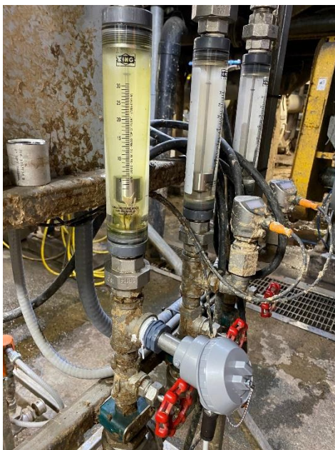
Figure 6: Traditional monitoring coupled with ALVIM probe

Management of microbial contamination in paper mills cannot rely solely on chemical treatments or corrective interventions applied after the fact. To reduce costs, waste, and production downtime, it is essential to detect early signs of biofilm formation and act promptly and effectively. The ALVIM technology has been specifically developed for this purpose. ALVIM Sensors enable real-time monitoring of biofilm development within water circuits, detecting its presence from the earliest stages. Compared to periodic laboratory analyses or indirect checks, the ALVIM System provides continuous and precise information, allowing for proactive and targeted management strategies. This approach optimizes the use of biocides, resulting in reduced operational costs and environmental impact, while minimizing the risk of microbiologically influenced corrosion (MIC) and biological deposit formation, preventing production defects, and reducing waste generation. The outcome is improved stability in