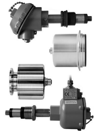
Figure 5: ALVIM Biofilm Sensors

product quality, and a more sustainable resource management. Integrating a monitoring system like ALVIM into production processes provides a tangible tool to balance productivity, quality, and sustainability, strengthening plant resilience while ensuring compliance with increasingly stringent environmental regulations. In a European paper mill specialized in tissue paper, the ALVIM System was installed on a white water recirculation line , a known critical point for biological deposit formation. After only a few weeks of monitoring, the Sensors detected initial biofilm growth that had not been identified by either periodic microbiological analyses or ATP measurements. This early warning enabled staff to check and adjust biocide dosing. At the same time, a decrease in production defects (sheet breaks and biological stains) was observed, with an estimated annual savings of several tens of thousands of euros in downtime and waste costs. This case demonstrates how continuous biofilm monitoring with ALVIM Sensors can become a solid competitive advantage, improving both final product quality and operational sustainability.