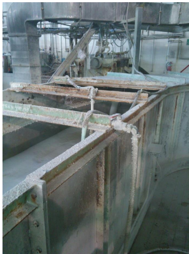
Figure 1: Paper mill